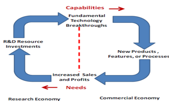
Figure 1. Virtuous cycle depicting how R&D resource investments are replenished through increased profits in the commercial economy in a thriving innovation ecosystem.