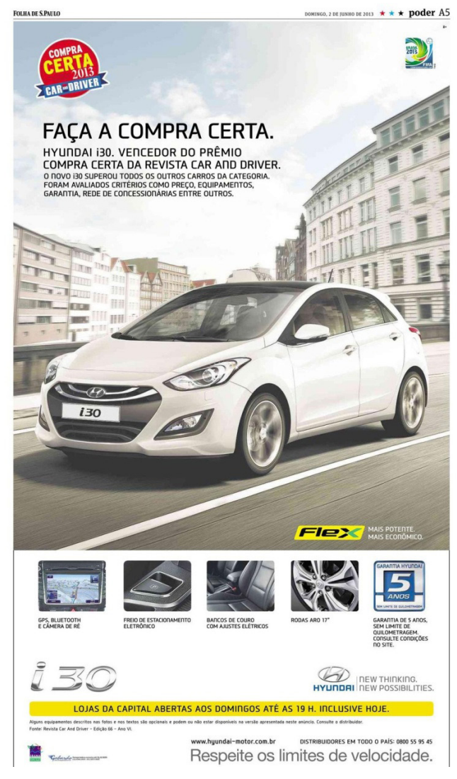
Figure 1 – Image from Folha de São Paulo newspaper, Political Section, June 02 2013.