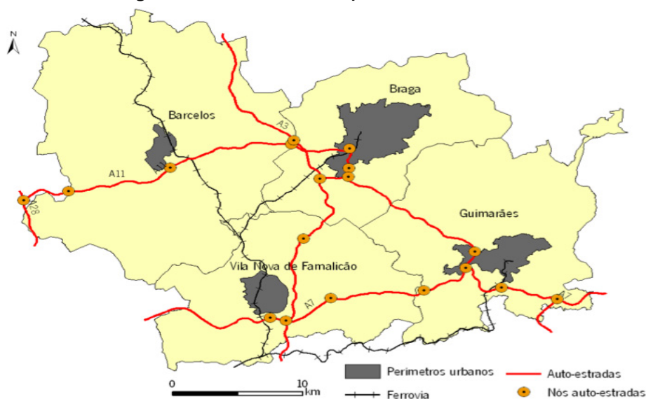
Figure 1 - Quadrilateral territory and main communication routes

Barcelos, Guimarães, and Famalicão are part of it (Figure 1), whose perimeters border each other and are connected using transport that facilitates rapid movement between them, although there are still shortcomings, particularly in terms of supply.