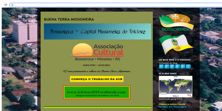
Figura 01: ACB's blog