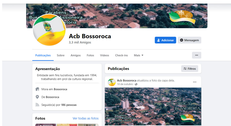
Figure 02: ACB's Facebook page