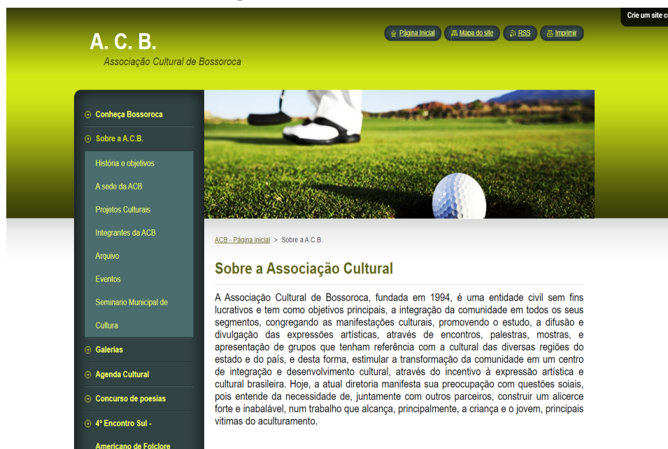
Figure 04: ACB's second Website